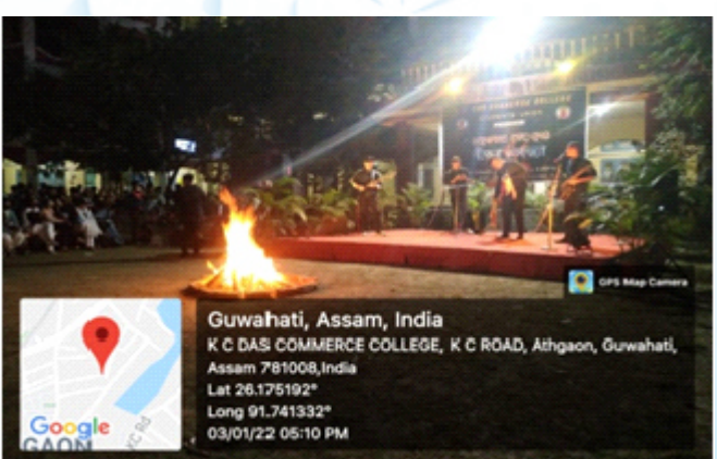
7th & 8th January 2022

The Alumni Association of K. C. Das Commerce College in a joint collaboration with JCI Guwahati, organized a Mega Kids Covid Vaccination Camp for children in the age group of 15-18. It was a successful event conducted by the efforts of both the forums.